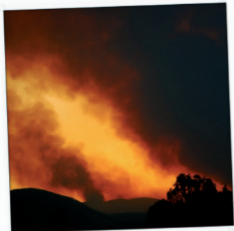
Greek forest on fire. Climate change concerns all of us.

eCLAU strives to raise awareness and seeks to integrate youth civil society organizations and local authorities with political discussions in order to increase their role in these discussions and within the democratic system of the EU. Tackling climate change from the bottom up with the particular participation of Youth will ensure its success and will bear the opportunity to bring Europe closer to its citizens.