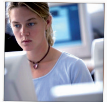
The site www.e-clau.net is the core of eCLAU project.