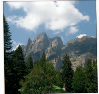
Rila Mountain (BG). Preserving ecosystems to stop climate change.

The web page www.e-clau.net is the central core of the eCLAU project. It gives more information about the stages, the workshops and about participating in the social network for young Europeans. If you are young do not hesitate to visit our website and participate in the debates or to send us possible news, articles, photos or other such relevant materials!!!