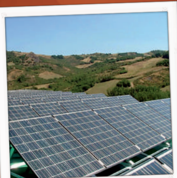
A photovoltaic system in Reggio Emilia (Italy).