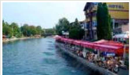
A perspective of Lake Ohrid