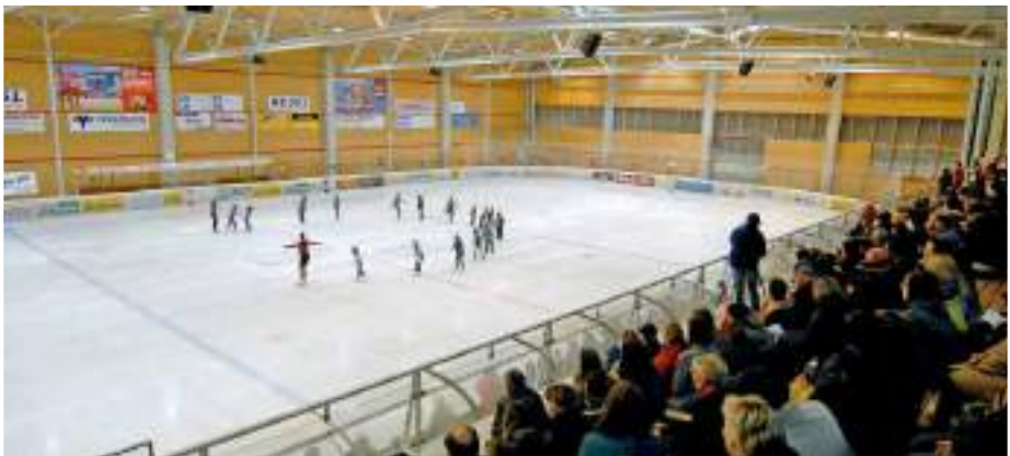
Spittal Ice rink

Without the element of water the snowfall system, much loved by winter's guests, would be impossible. That is to say that water guarantees – even in low-snow winters – snow-covered pistes. Fortunately Spittal is a water-rich region.