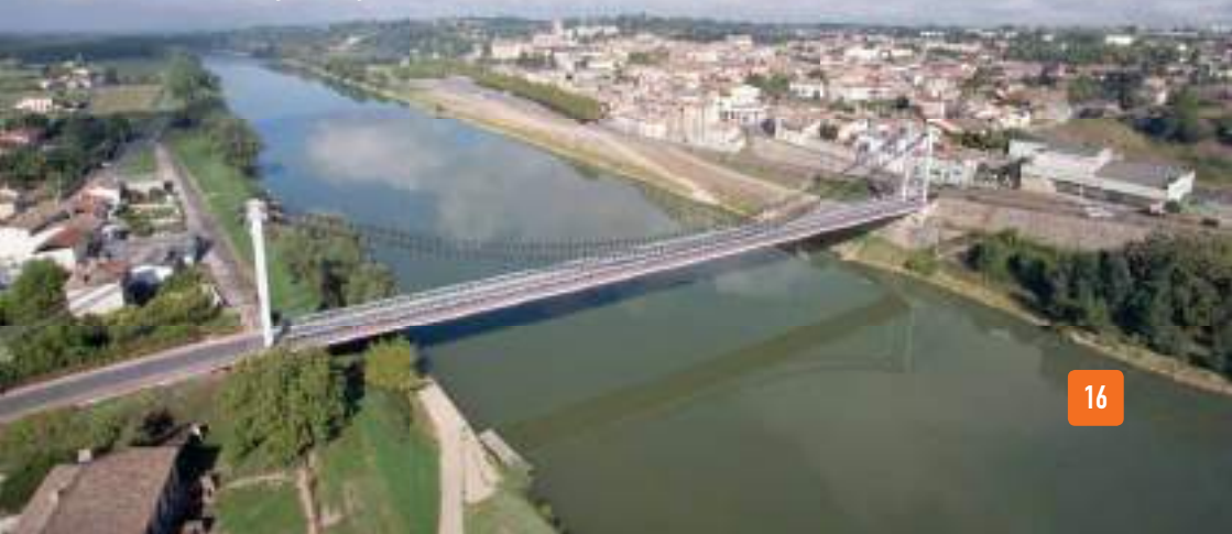
View from Rouergue bridge

Thanks to the RER, the enterprises can benefit from a qualified and trusted source of information and establish working links among local companies. The facades restoration policy has prominently increased the revenue of entrepreneurs and, as a consequence, their financial results. It has also contributed to improve the look of town districts. With regard to RER, enterprises are able to mutually help each other and can develop faster thanks to the communication network created within the association. All the members frequently interact with each other and are constantly kept up to date about construction works and social development projects.