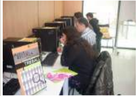
Classroom of assisted search of work (The municipal area of Economy)

of social, civic and cultural organizations. Participating to the project has been a good experience for us, as we took part to a global meeting with our European neighbours. We had the opportunity to get to know how other cities develop their local government in favour of the society.