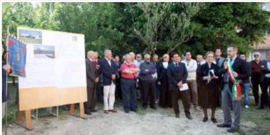
Daily Senior Center - Laying of the first stone