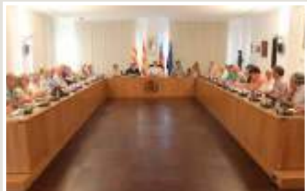
One session of Meeting of Civil Participation (The municipal area of Civil Participation and Neighborhoods)

Thanks to this project we have met with our twin cities, which are Burriana and Michalovce. Finally, we feel the need to highlight that this kind of experience has a key role in demonstrating the importance of the citizens in the construction of a new global and advanced European Union.