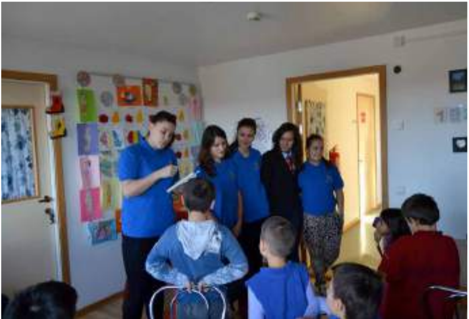
Volunteers from high school spending some hours with Roma abandoned children