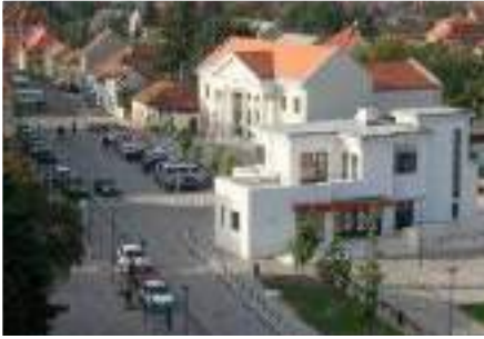
The renewed Main Square

The community; non-profit organizations; cultural, traditional, environmental and sport events