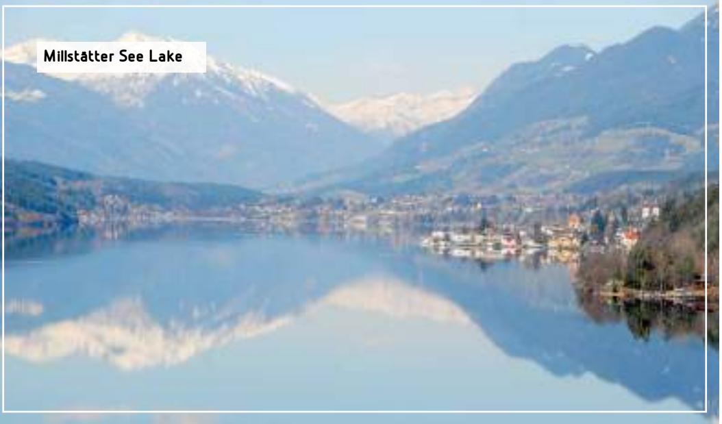
Millstätter See Lake