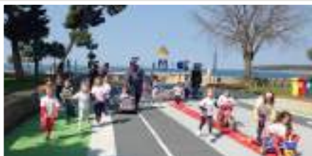
Citizens initiative "Andemo tutti in piazza - Let's all go to the square". The purpose of this traffic polygon is to educate children in traffic safety

City administration initiatives: development of the industrial zone in order to enable the economic growth and employment; development of public infrastructure (sewage system, roads, kindergarten, sport facilities etc.); spatial planning; development of urbanistic plans; interest rate subvention for the entrepreneurs; co-financement of the project documentation for the entrepreneurs; subventions for the citizens/households (green energy and energy efficiency projects); organization of workshops and lectures for the citizens and entrepreneurs (EU funds, energy efficiency, volunteering etc.). NGO's initiatives: ECO DAY, an event that takes place each year where citizens and volunteers clean the city, beaches, the sea etc.;