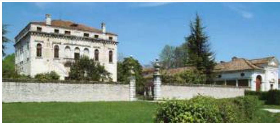
Villa Correr Dolfin