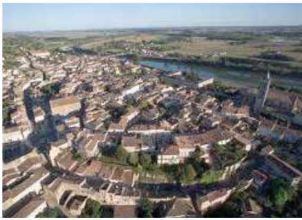
Aerial view of La Réole.

RER Association, Facades renovation policy