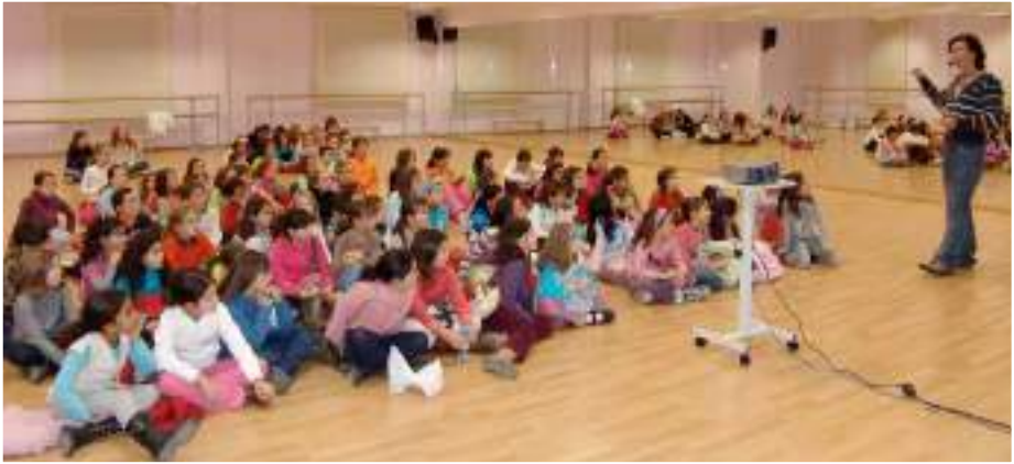
Arts Center of Viciana Rafael Marti de Viciana

Cultural, natural and historic resources