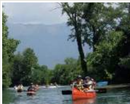
Livenza river, tourist and sport resource.

The city of Sacile can count on different resources: Livenza rivers’ water is a tourist, industrial and sports resource, also very useful for rescue purposes. Tourism is a further resource for business and accommodation facilities, in particular thanks to the artistic and historical heritage and the excellent manufacturing, such as Fazioli’s pianos. The “Healthy Cities Network” to which Sacile belongs and the “Sacile model” are an example for the entire region. Mention should also be made of the significant number of dynamic volunteering associations in the city, like the municipal group of Civil Protection.