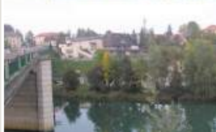
Before and after