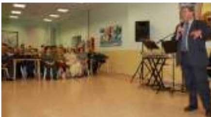
Specialized Center of Care for Elderly

Participating in this project has been very rewarding for us, as we have been able not only to share our actions with the other members of the project, but also to learn from other countries first-hand experiences, which can be easily exported to ours. Thanks to the good relationship established during the project, we will continue to share experiences with each other and this will result in a continuous improvement of our community.