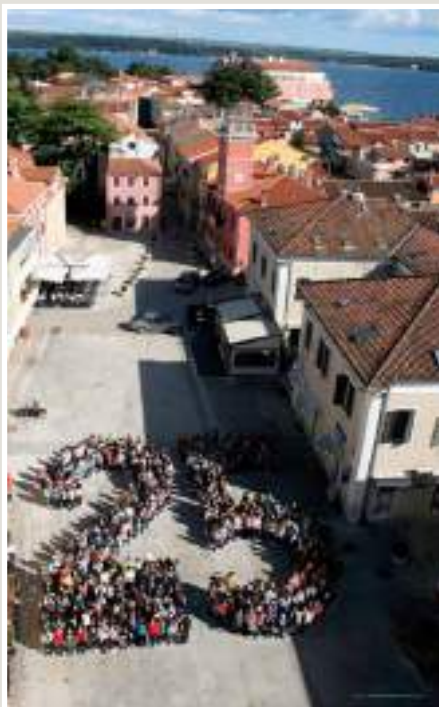
Children's creativity workshop "Primavera cittanovese - Novigrad spring"

IPARD - Sewage system construction in the settlement Bužinija). The implementation of the REACTION project has been successful for our municipality because we expanded contacts with new partners. During the project we have exchanged best practices, like the experience of implementation of environmental/educational projects in schools (Spittal an der Drau - Eco detectives). Also this was a great opportunity to involve our citizens in three international events and to gain valuable experience of participation in such EU projects. We believe that the cooperation between these partners will continue and that we will with joint efforts implement other initiatives and projects.