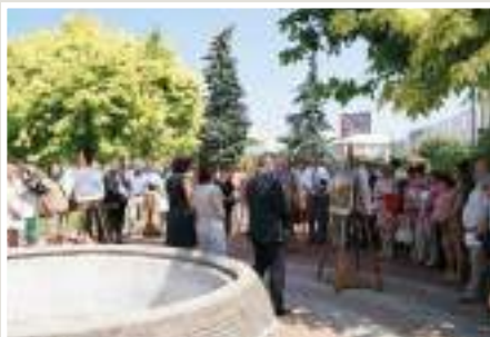
Communication within culture, sport and social events

The Town of Michalovce is celebrating its 770th Anniversary this year. This is a really important anniversary and also a great opportunity to engage people in discussions about history, culture heritage and current affairs closely connected with European Union, European citizenship and civic and democratic participation at Union level.