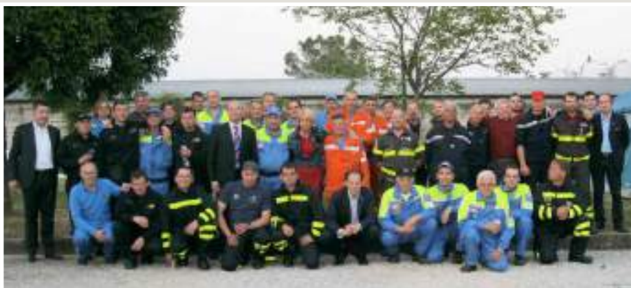
Town twinning, partnership activity (Town Twinning - water)

The Livenza river runs through Sacile offering a wide range of benefits: spectacular rescue demonstrations are performed by various delegations of the network of European twinned towns and coordinated by the municipal group of Civil Protection.