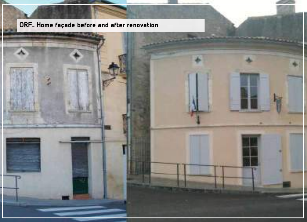
ORF_ Home façade before and after renovation