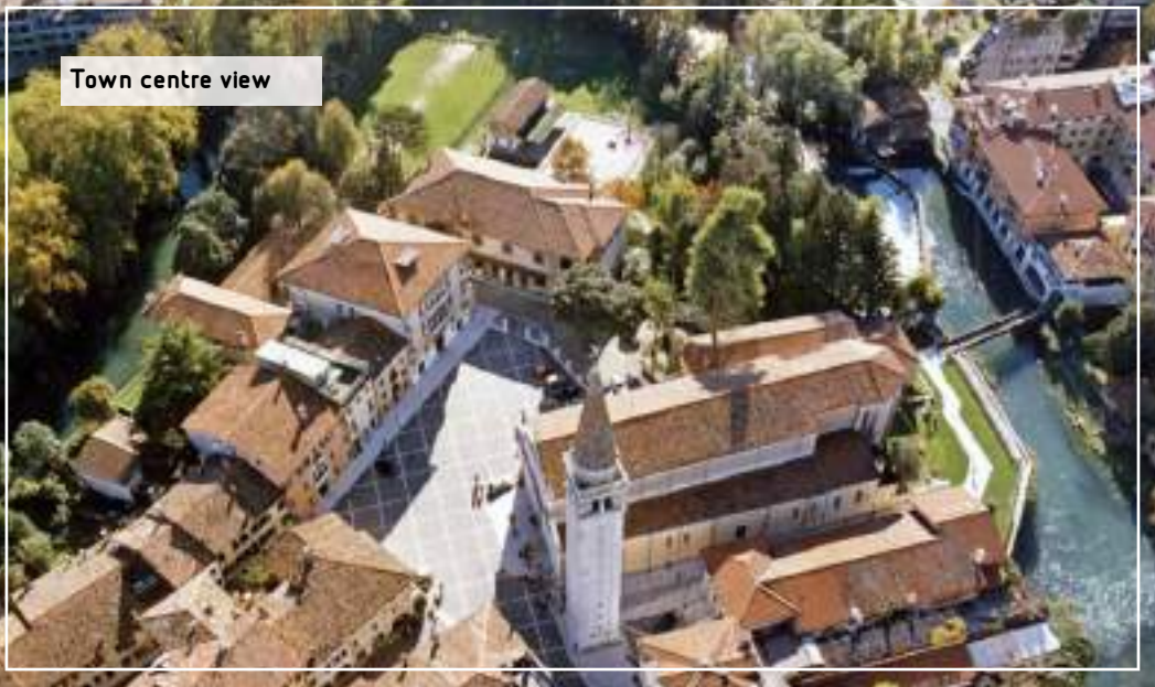
Town centre view