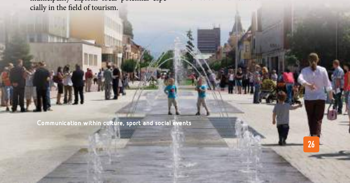
Communication within culture, sport and social events

Methods of communication: 1. Face to face communication - public meetings (Yearly meetings of the municipality with the town citizens and Citizens' questions answered on the spot or by a written reply) 2. Electronic communication (Questions - Answer Forms, E-mailing, Questionnaires and public research with the publicized outcome) 3. Communication through representatives of the target groups (Seniors' Council, Private sector Council, Religious Council, Roma Council, Sports Club Council, Youth Council, Municipal Youth Council, Operative meetings with special target groups based on particular needs) 4. Tourist Information Centre - First contact point - in-office communication.