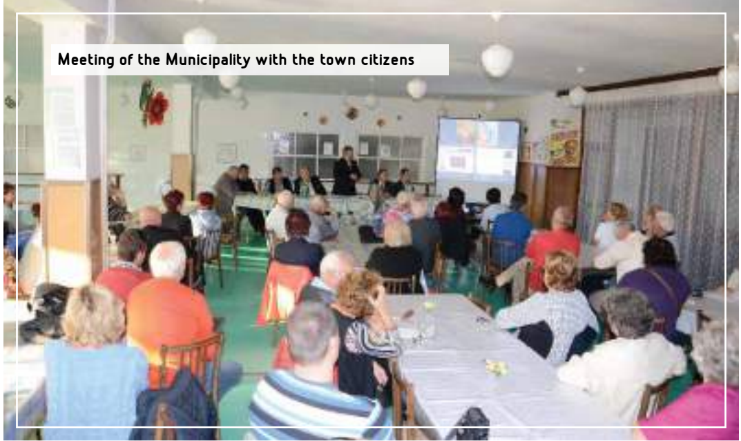
Meeting of the Municipality with the town citizens