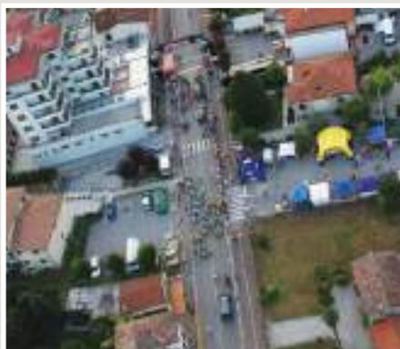
Bicycle racing promoted by the Association Team Orogildo

With regard to actions in favour of elderly and, more in general, of people in need there are many associations like Brugnera Solidale, primarily active in the field of seniors' health care, providing them a transport from and to the hospital, helping them get home delivered drugs, etc. Last year a daily Senior Center for not self-sufficient old people was opened. The Center can accommodate up to 20 people and provide many services from people care to leisure and social activities. Younger people education and learning is supported by the Parents Associations which collaborate with the Office of Cultural Affairs and the local educational institutions. Besides, the Attivamente Association operates in favour of children, organizing kids activities at the Public Library of Brugnera. Every year the municipality publishes information materials on the resources provided for citizens, families and associa-